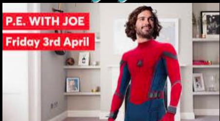
P.E. with Joe | Week 2